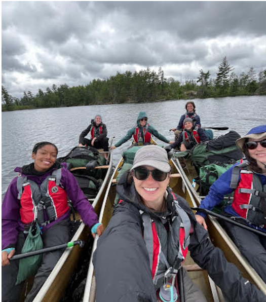
A scene from the 2024 expedition to the Boundary Waters.