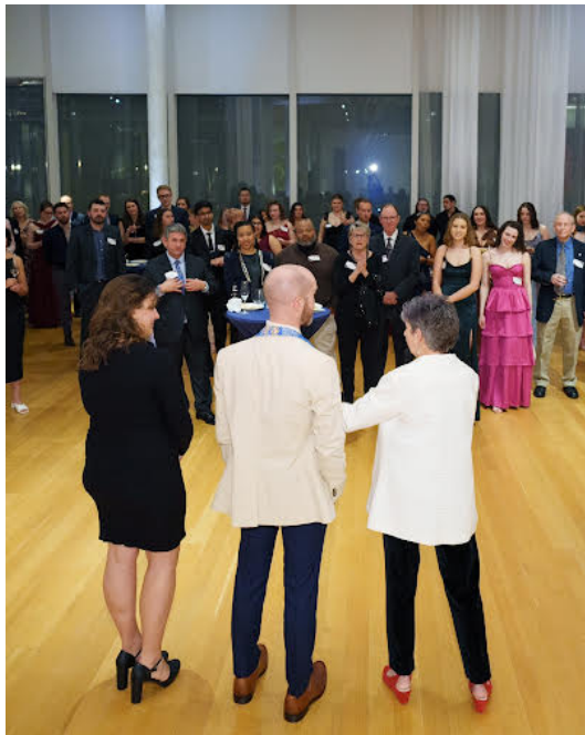
Addressing the crowd at the 2024 Gala.