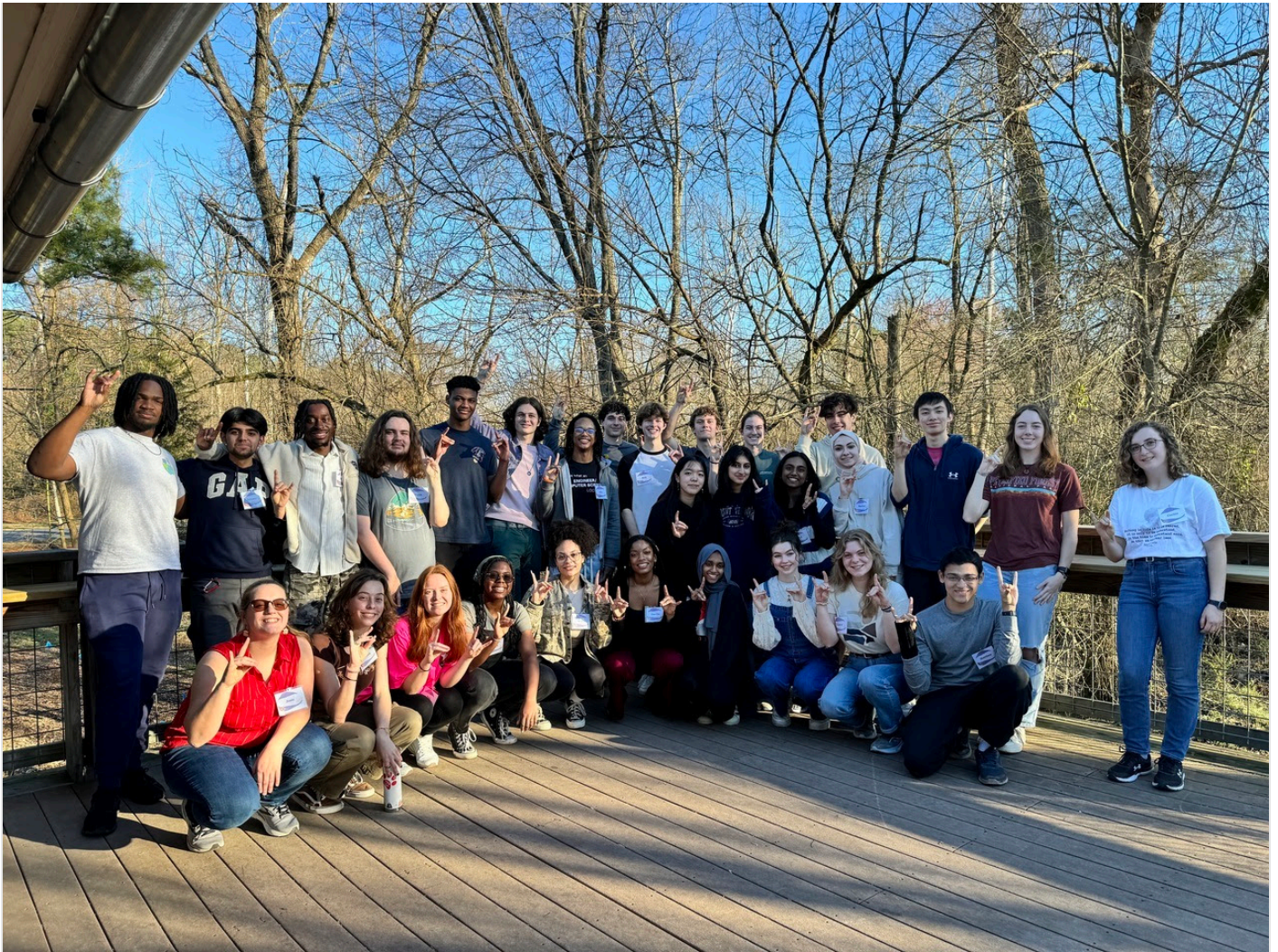
Members of the Caldwell Class of 2027 at Walnut Creek Wetland Center.