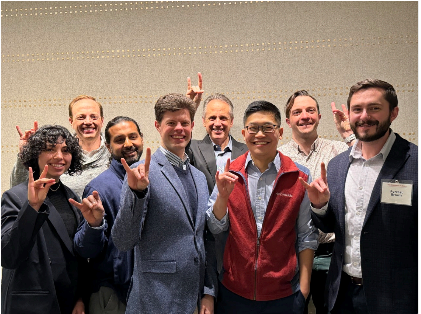
Caldwell Fellows alumni at the UMass club during our Boston Urban Adventures trip in March.