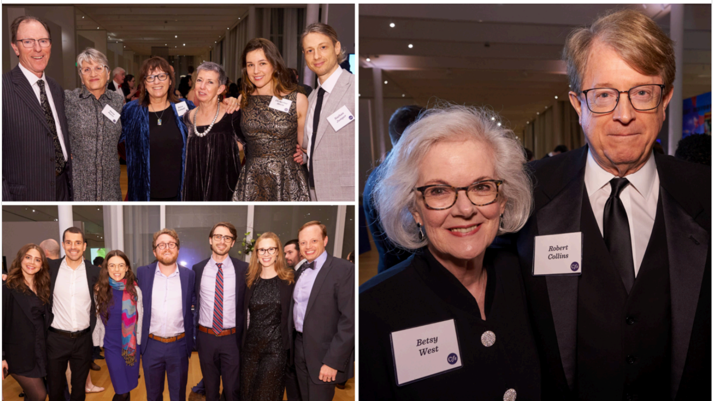
Smiling faces from the 2023 Caldwell Fellows Gala.

With an initial semester behind them and a GPA of 3.25 or higher, NC State first-year students may apply by January 8th for the Caldwell Fellows class of 2027. We have seen a steady rise in students' interest in the program over the past few years, and while we have a generous number of reviewers, a record number of applications means that we need more folks to read and score eight applications between January 11 and 18 . Please email Janice directly ( janice_odom@ncsu.edu ) if you can serve in this virtual role. You may also let her know if you are interested in one of the few remaining spots for interviewers for in-person selection day on February 24th.