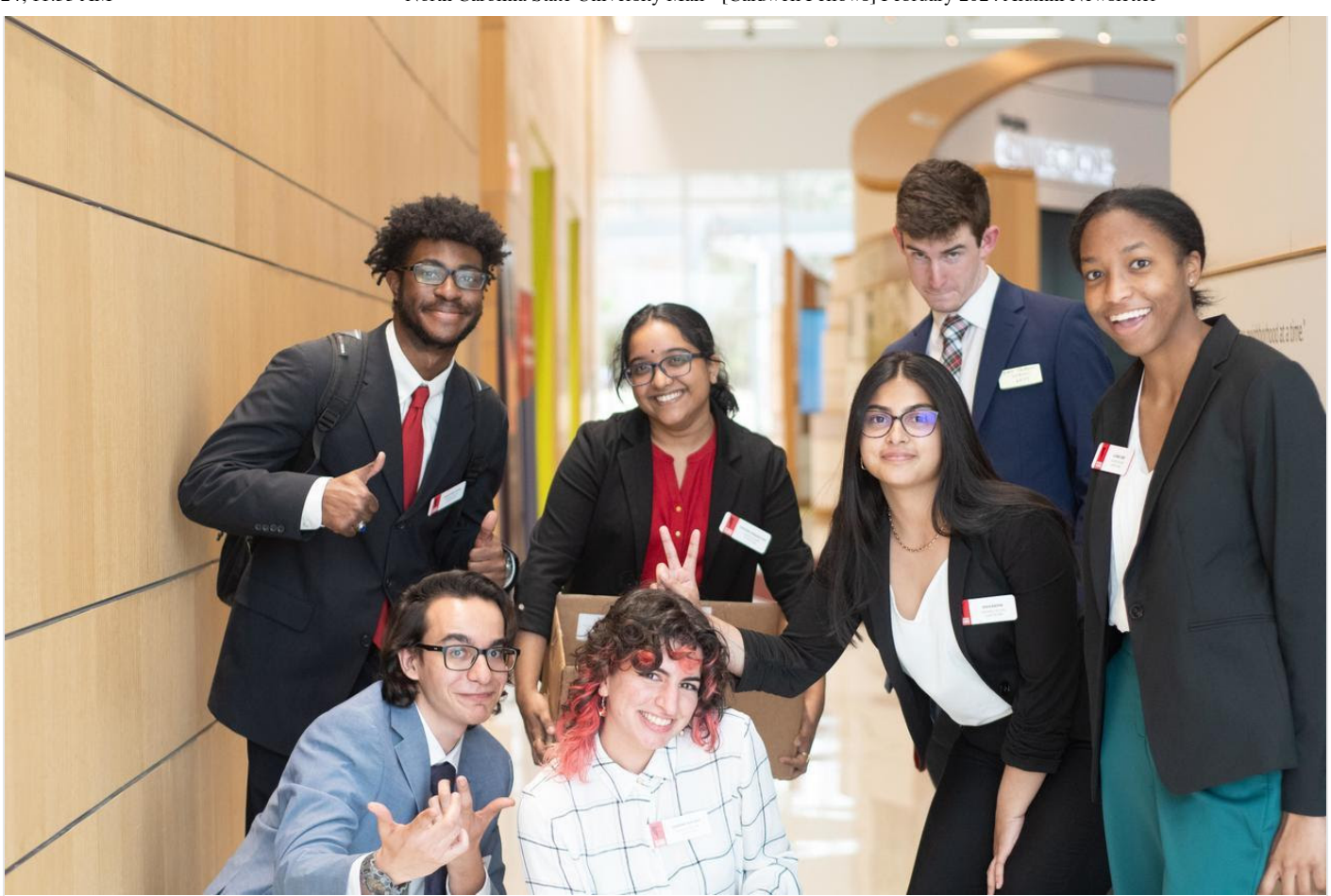
Smiling faces from a previous Selection Day.