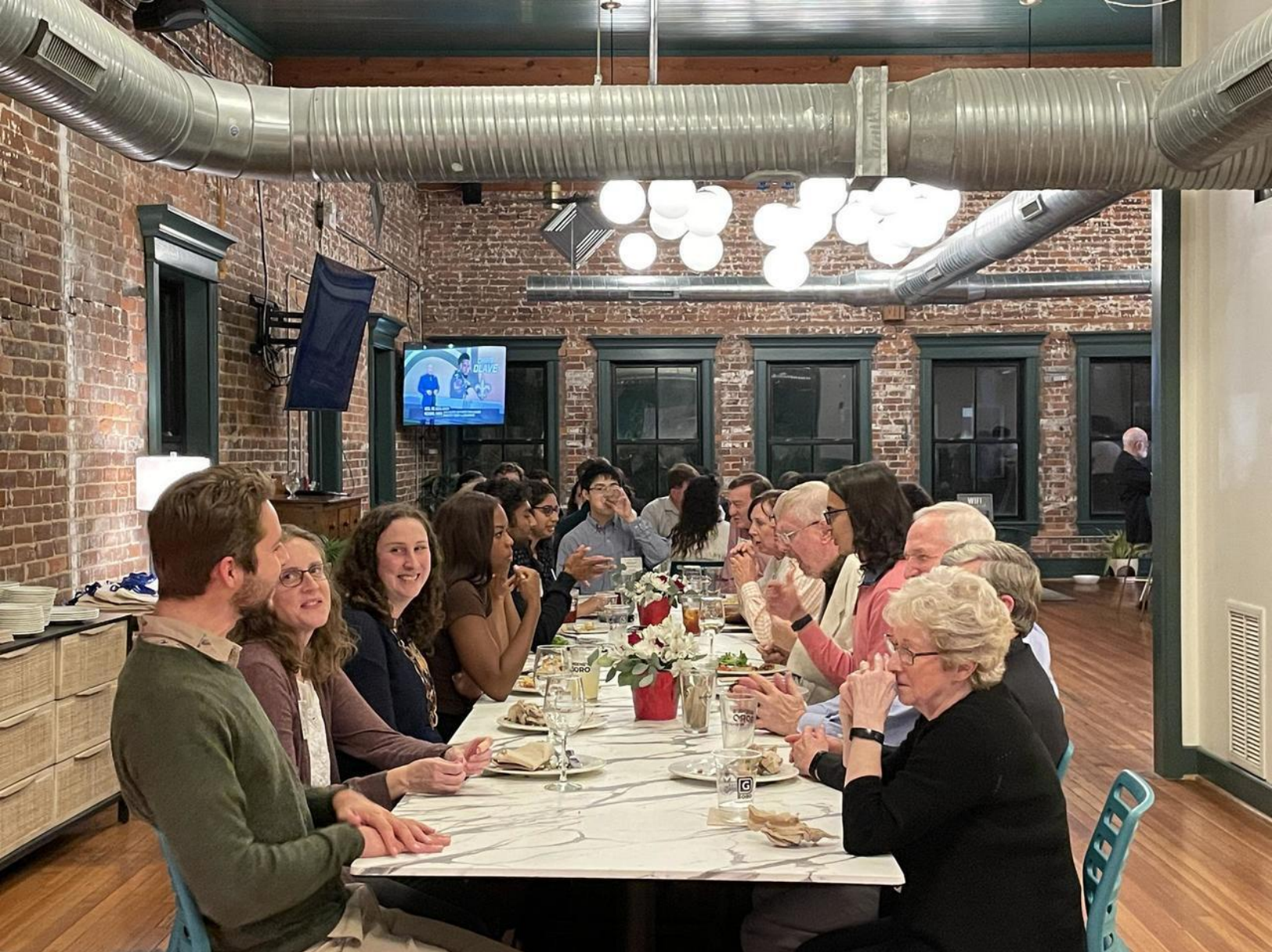
Current students, alumni, and friends in fellowship in Greensboro, NC.