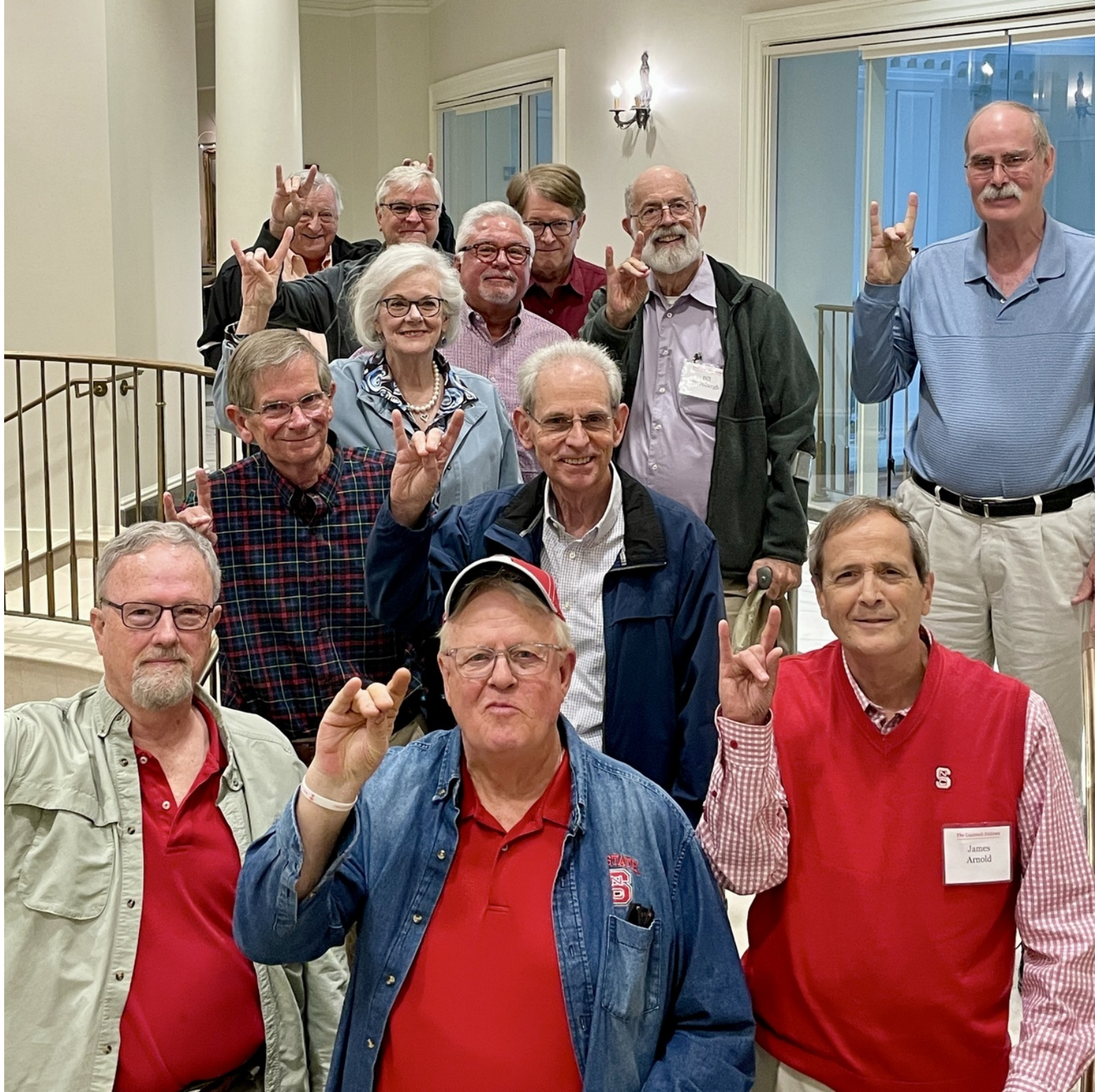
Guests at the Caldwell Fellows Classes of 1970s reunion held September 23 and 24, 2022.

The semester is full steam ahead; the weather is turning cooler, students are getting ready for mid-term exams, and fall break is upon us. We've hosted several amazing events in the last month and we are excited to be building momentum towards our 55th Anniversary weekend.