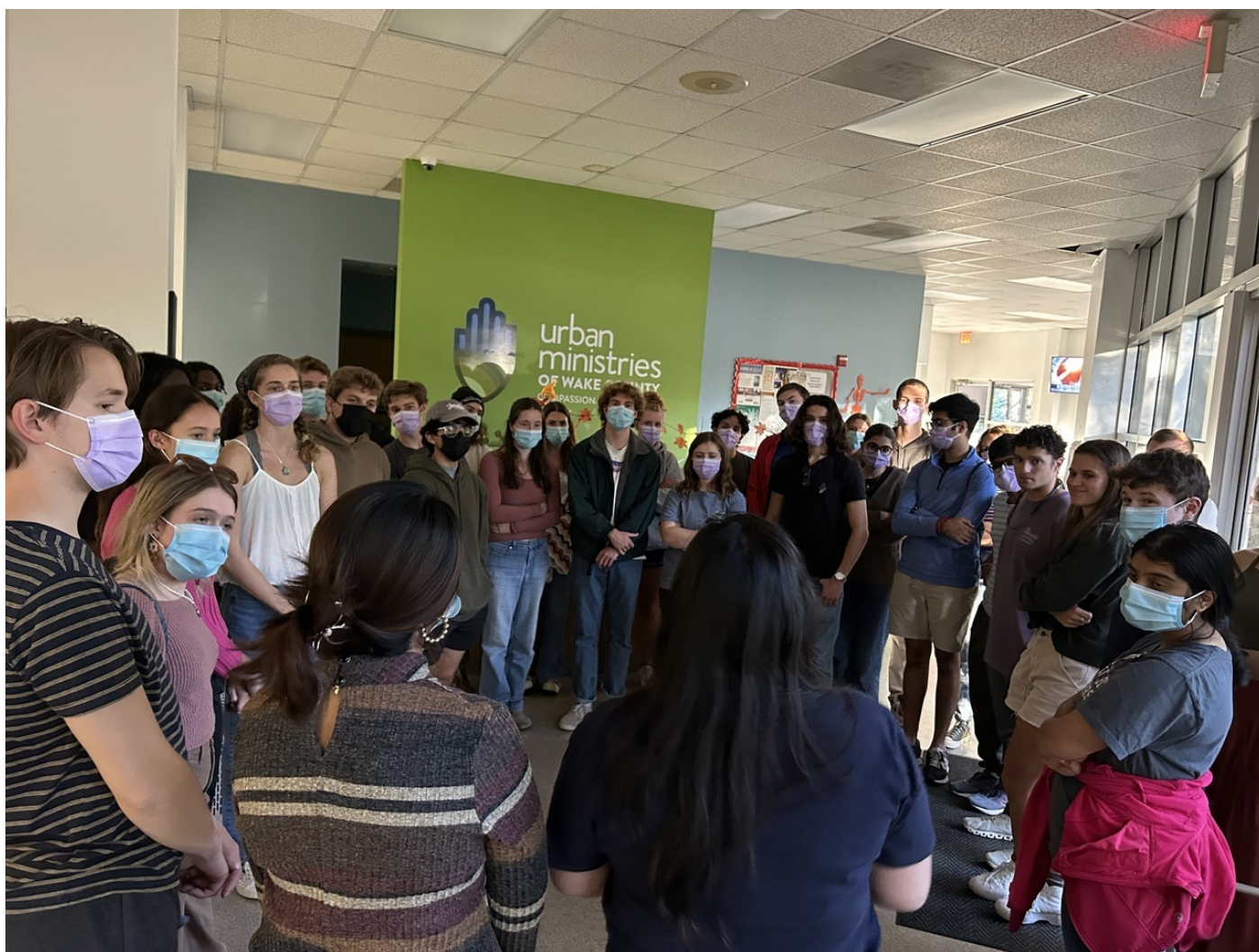
The Class of 2026 Fellows on their sophomore seminar field trip visiting our six service-learning partnerships. The Open Door Clinic is our longest community partnership; 15+ years of Fellows have served at the Clinic.