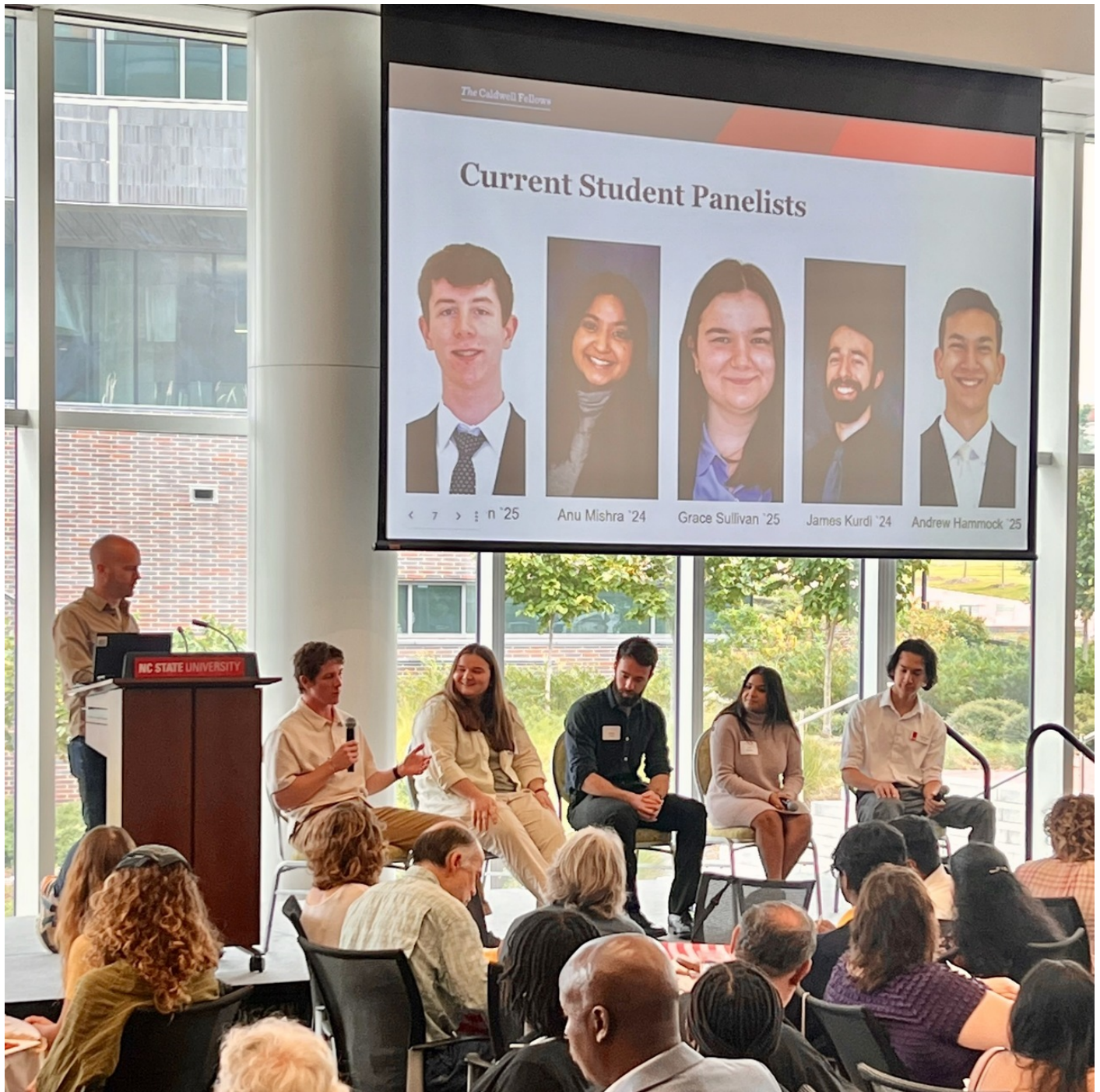
Current Fellows panelists at the inaugural Caldwell Families Breakfast.