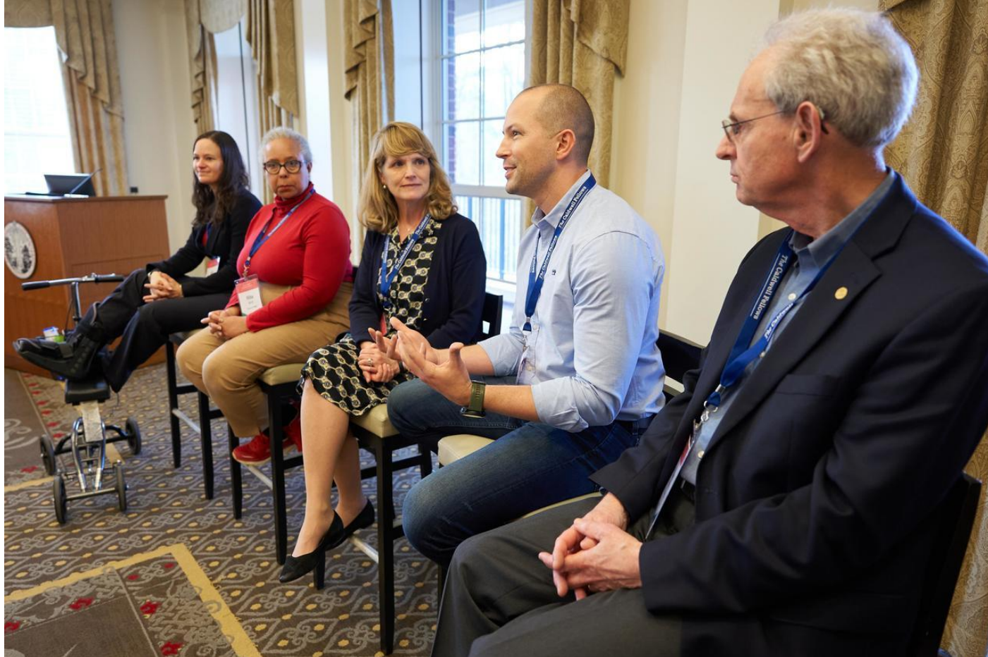
A scene from last year's Selection Weekend Alumni Conference.