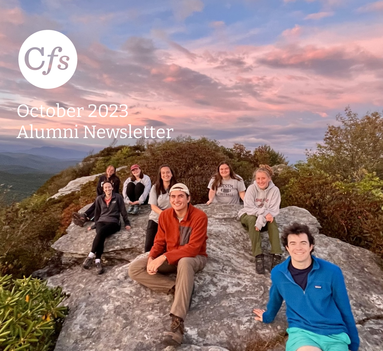
Caldwell Fellows and Outdoor Adventures staff on a trip to Linville Gorge.