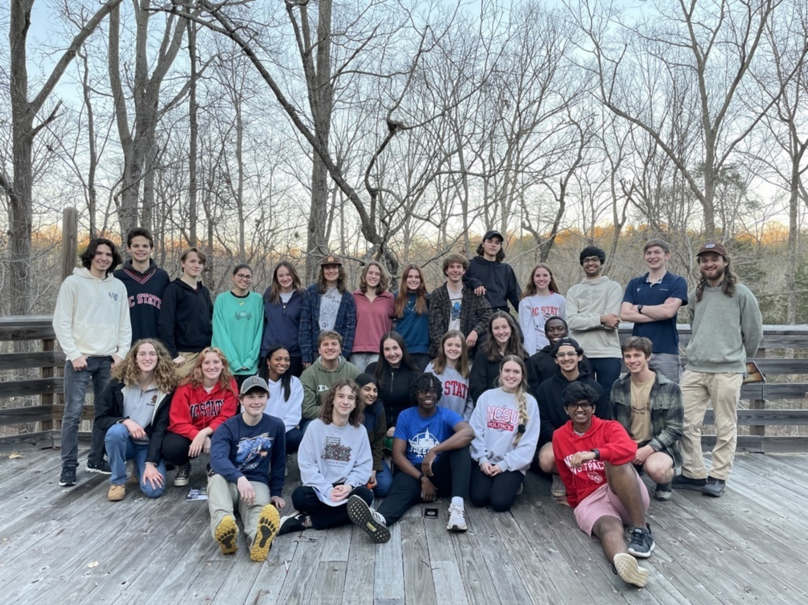
The Class of 2026 at the Haw River State Park retreat center.