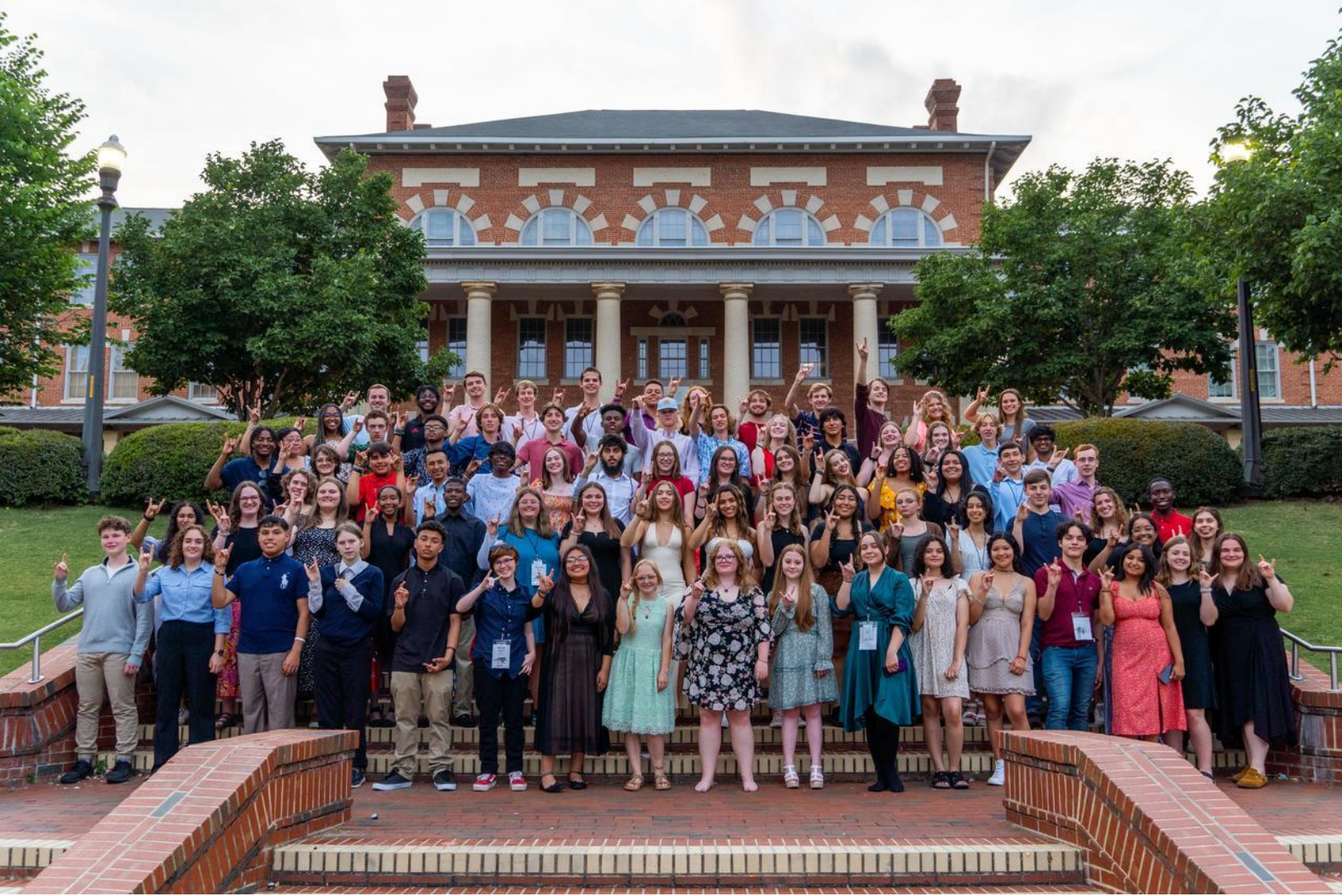
SATELLITE campers and counselors.