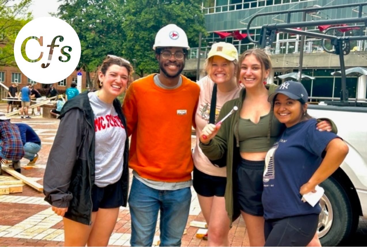
Members of the Habitat for Humanity Shack-A-Thon Team.