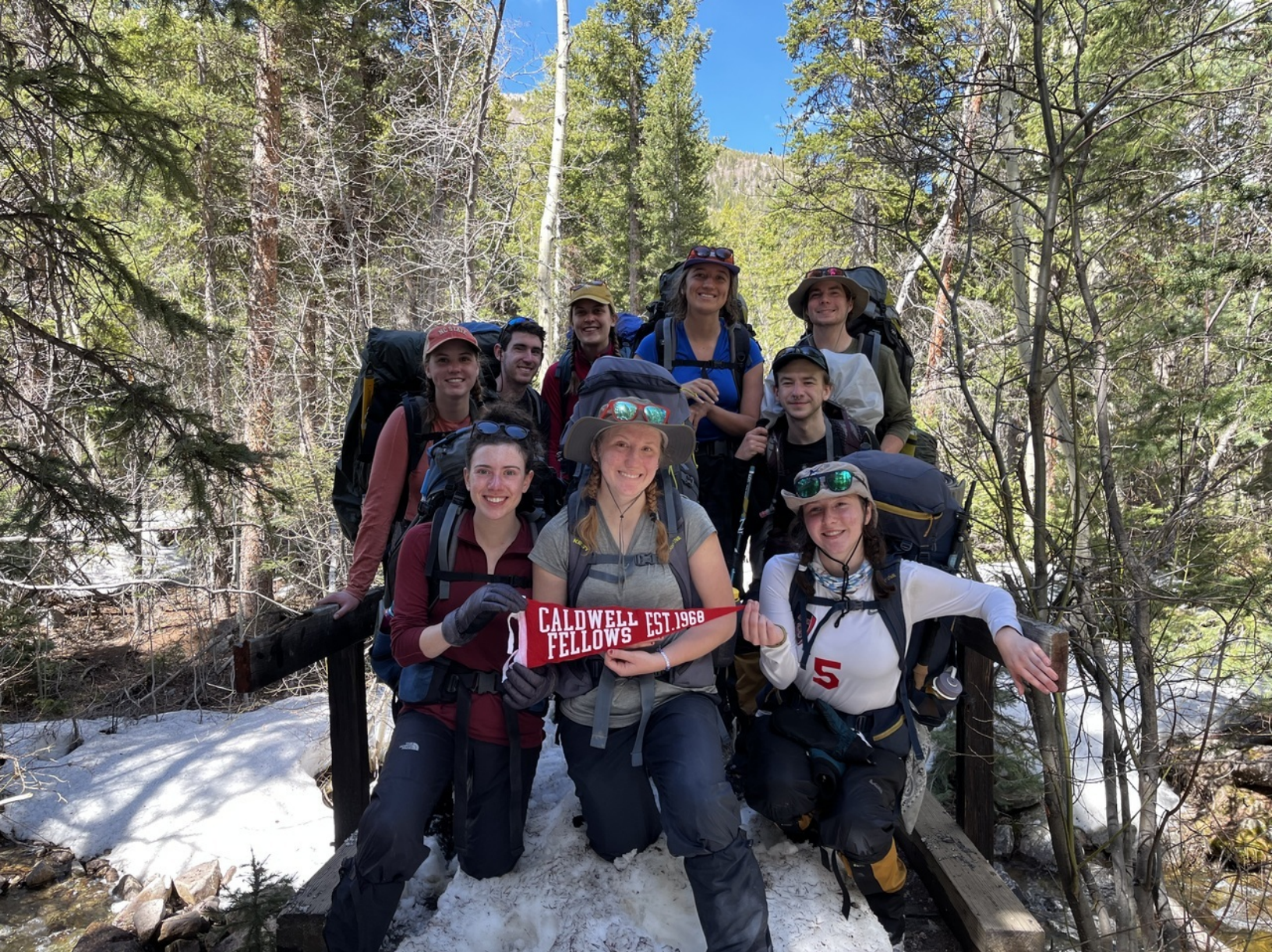
The 2023 Wilderness Expedition members.