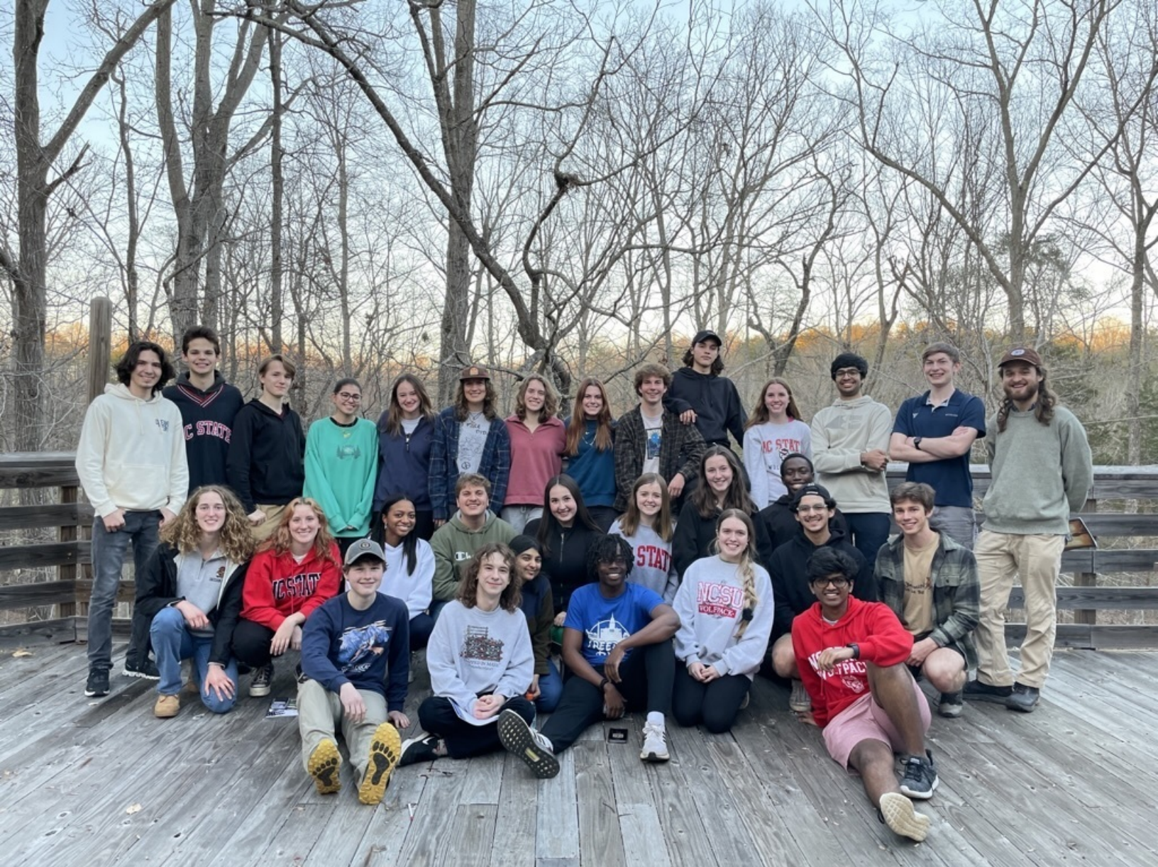
The Caldwell Fellows Class of 2026 at Haw River State Park.